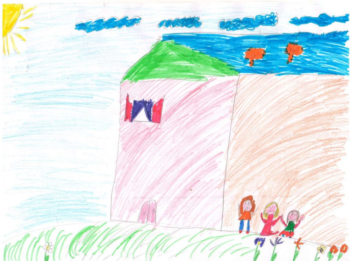
Name of artist unknown, child's drawing of a house, Belarus.

SOS CHILDREN'S VILLAGES A loving home for every child